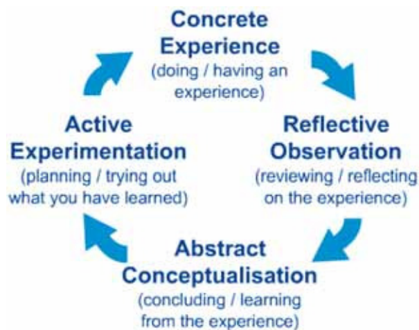
Fig. 1 Kolb's learning model [10]

Acquiring leadership competencies based on personal experience involve the use of all experiences, in families, peer groups, schools, and those obtained in meetings with other leaders and their own professional and leadership experience. Even the experience of young people is a great treasure of information, values and