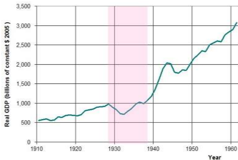
Fig. 1 USA annual real GDP, with the years of the Great Depression highlighted [1]

The first free zone appeared in the United States during the Great Depression. Free trade zones were defined by the act: Foreign-Trade Zones Act (1934).