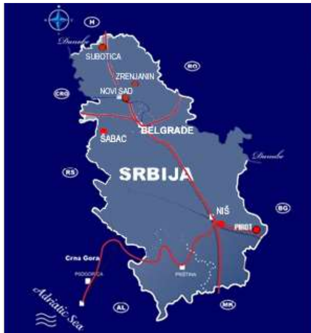
Fig. 3 Free zones in Serbia ( http://www.szns.rs/srbija.htm )